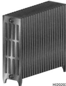
Table 3 Square feet EDR