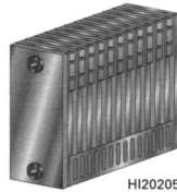
Table 2 Square feet EDR