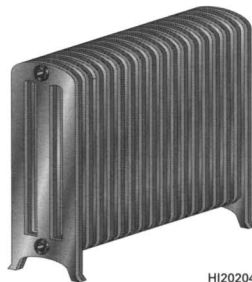
Table 4 Square feet EDR